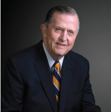
A few photos of MANY donors this fiscal year