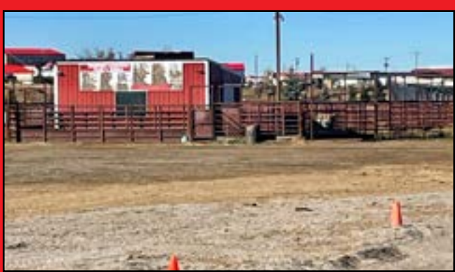
Page 4 www.cmmc.health Winter 2024