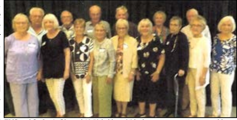
There were 78 students who FHS and St. Leo's Class of 1959 held its 65th class reunion in August and have graduated from Fergus in 1959, set up a scholarship fund for FHS graduates.

The alumni held their 65th class reunion in August and had 14 alumni, along with spouses and friends, in attendance. There were 78 students who graduated from Fergus in 1959, and 13 from St. Leo's.