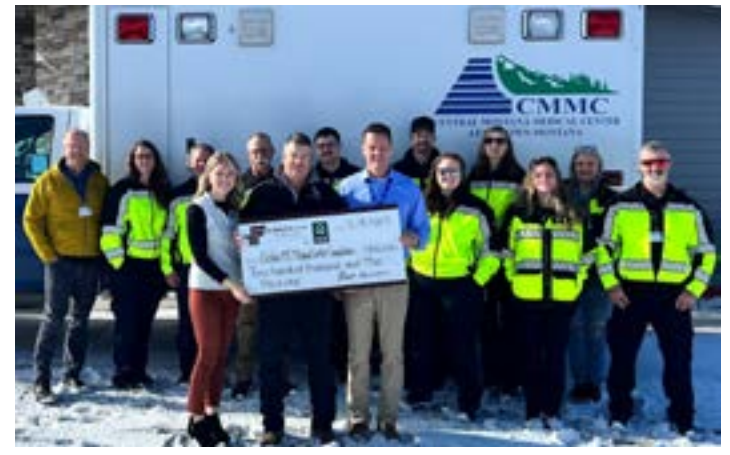
Grant funding facilitated by First Bank of Montana provided $300,000 for CMMC with $225,000 towards a new ambulance and $75,000 for the Cancer Center project.

First Bank of Montana and Bank of the Rockies both went the extra mile to garner funding for Central Montana Medical Center (CMMC) from Federal Home Loan Bank (FHLB) of Des Moines Member Impact fund.