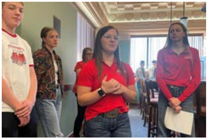
Fergus High School and Moore BPA and Fergus FFCLA received grants to assist students who qualified for national competitions.