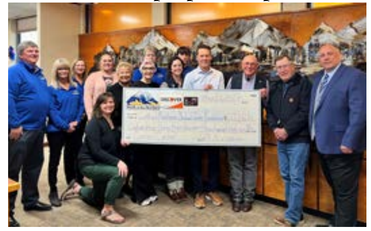
Grant funding facilitated by Bank of the Rockies provided $133,336 for significant enhancements for CMMC's Cancer Center Project.

Bank of the Rockies secured $133,336 from FHLB's grant program, and the funds will go towards significant enhancements for the Cancer Center. These enhancements include items that weren't in the final Cancer Center design due to unexpectedly high construction costs but are vital to the Cancer Center and CMMC long term success. Significant Enhance-